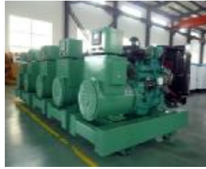
5 units cummins gensets exported to Angola