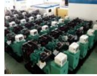
50 units cummins gensets exported to Pakistan