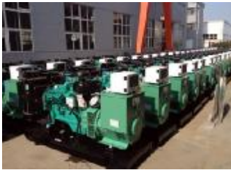
100 units cummins gensets exported to Asia