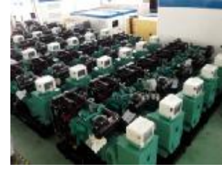
50 units cummins gensets exported to Pakistan