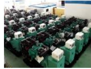
50 units cummins gensets exported to Pakistan