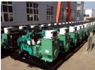
100 units cummins gensets exported to Asia